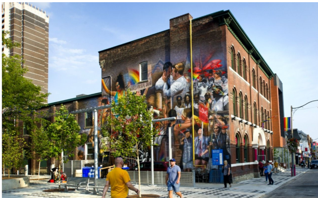
The 519 - Toronto, Ontario