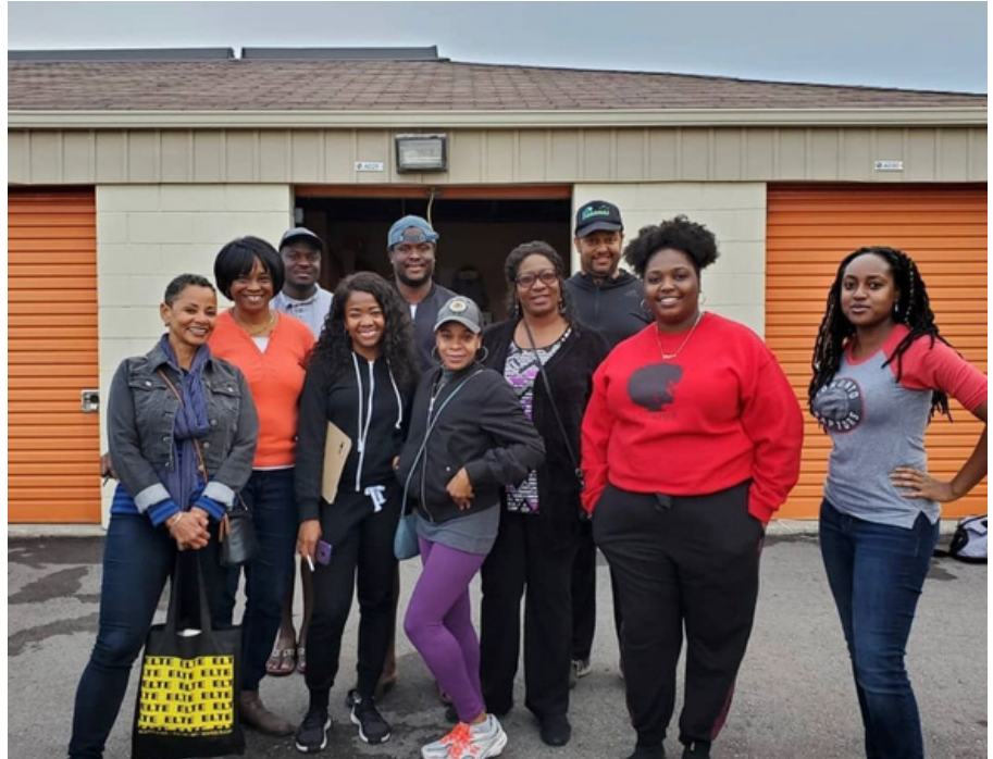
NABC group that came together to pack donated items to be shipped to The Bahamas.